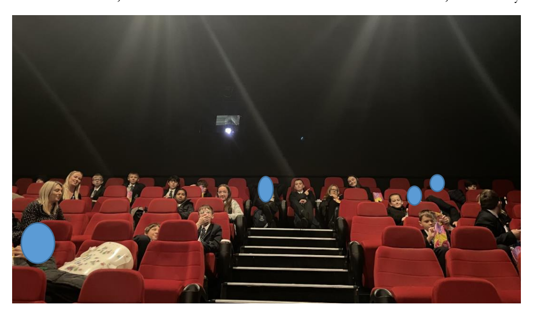
STUDENT OF THE WEEK

We took a group of Year 7 and 8 on a trip to the cinema as a reward for a good start to the year. The children watched an animated film, that related to Greek Gods and Ancient civilization, which they enjoyed.