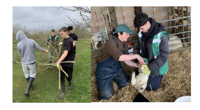
Day 4/ 5.

The students were excited to collect the eggs from the chicken houses. They all mucked in with cleaning and feeding the chickens. Followed by processing the eggs, these were washed, graded, stamped and dated. They continued to clear the orchard. The highlight was feeding milk to the little lambs.