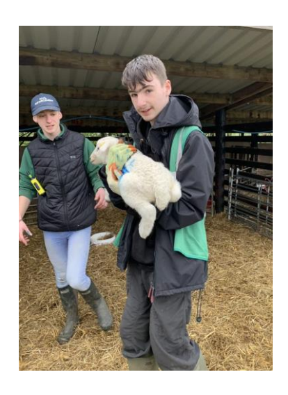
Day 2. Students split into three teams where they cleaned and fed the alpacas and goats.

Then a trip to the orchards to remove branches and trees to a pile ready for the woodcutter.